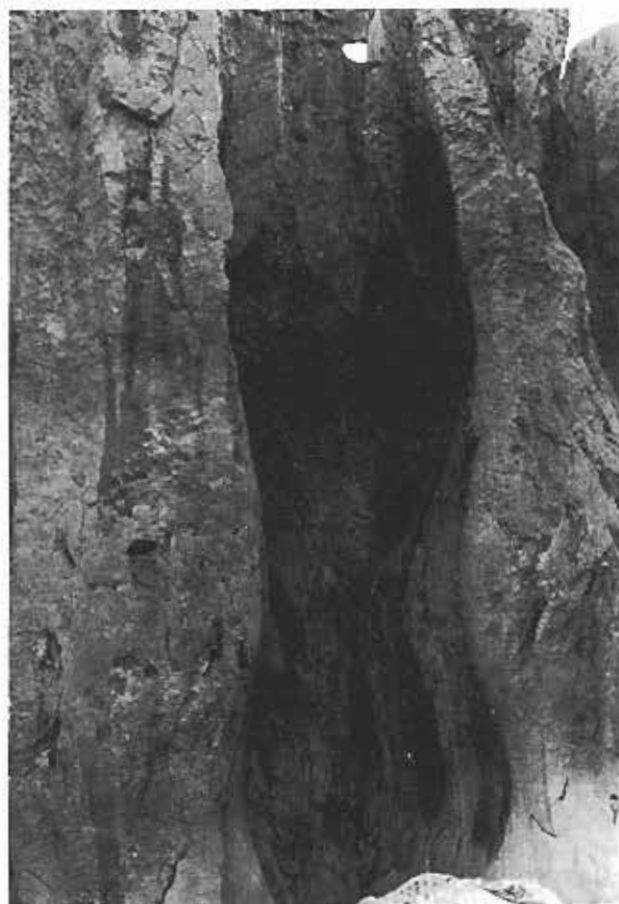
Fig. 4 - Subsoil erosion pits like the string of 2 heads.

The erosion of rainwater on the top of stone pillars has created the solutional cups, bows, basins, small gully and flut the depth of the both is from several mm to 1 m. The rainwater erosion is playing important role of shortening the stone forest. From this point of view, the speed of stone forest development is determined by the soil water and surface water but not by the rainwater.