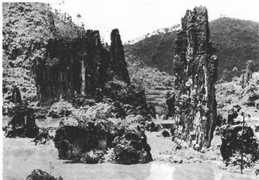
Fig. 2 - Stone forest in Xiaopaiwu karst depression, Huayuan, Hunan Province.

The depression and valley-stone forests are characterized by the big dimensions, large distributing areas and stone pillars perfectly separated. Take Lunan sone forest for example, the Dashilin, Xiaoshilin and Mother-son going for a walk etc are all developed in the karst depressions covered by one metre or more Quaternary sediments and with many karst dolines, sinkholes and subsurface drainage systems. The Sword Peak Pond is a typical karst natural lake. During the rain season, the water could be drained out by the underground drainage system, the groundwater table will rise up, sometime, the depression is flooded: for example, the tourist path in Unique Scenic spot depression was covered by over one metre of water. Another example is that there is a surface stream in the Xiaopaiwu karst depression which the stone forest develops in (Fig. 2).