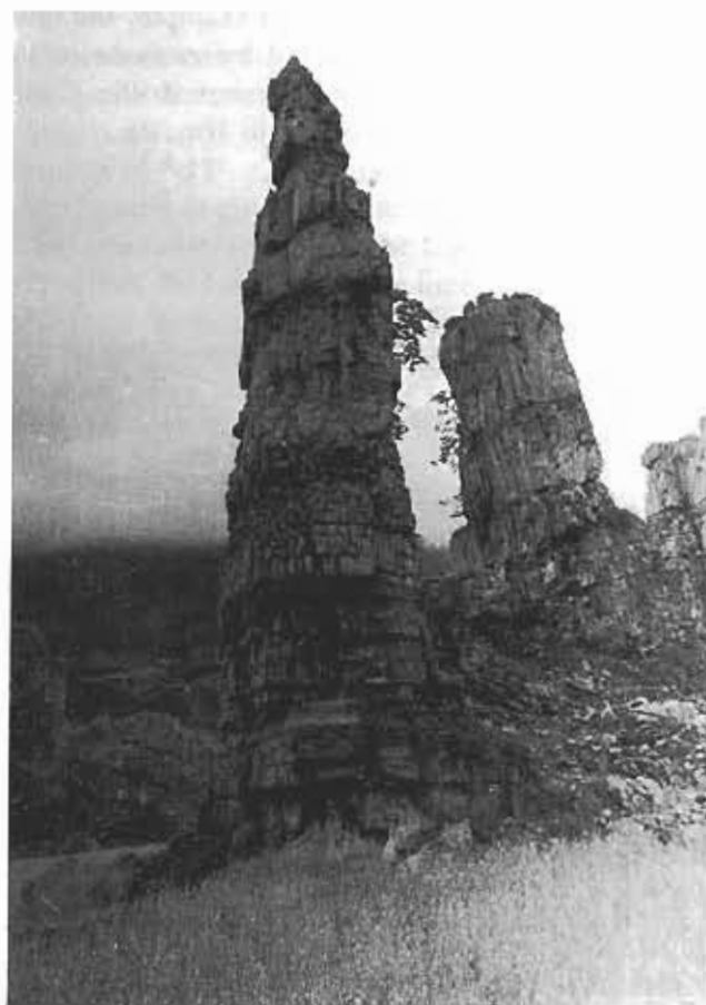
Fig. 3 - The stone pillars on one base.

The features are between the stone forests of depressions and hilltop. It is closely related to the stone teeth.