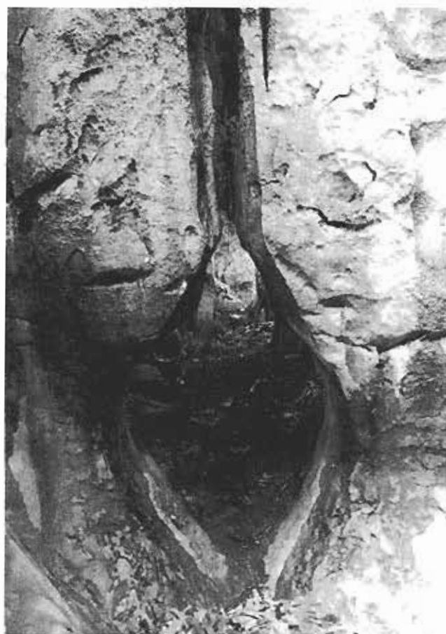
Fig. 5 - Horizontal subsoil erosion tube.

In fact, the relationship between stone teeth and stone forest is very